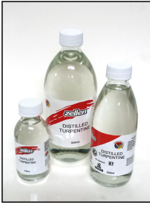
Distilled Turpentine (essential oil) Available in 100ml, 250ml, and 500ml. (A31, A231, A531)