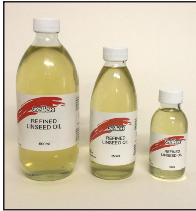
Refined Linseed Oil Available in 100ml, 250ml, and 500ml. (A32, A232, A532)