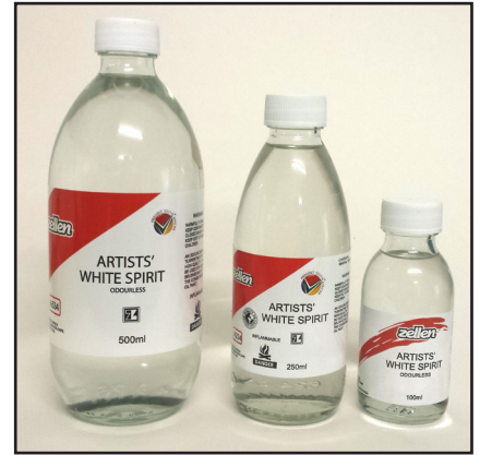
Artists' White Spirit (odourless) Available in 100ml, 250ml, and 500ml. (A34, A234, A534)