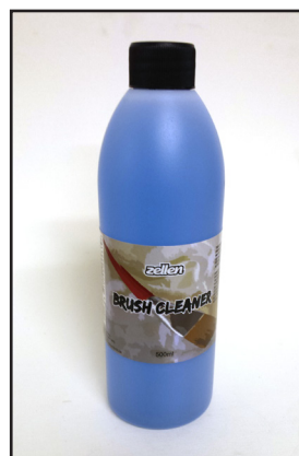
Brush Cleaner Environmentally Friendly, non solvent, odour less, water based brush cleaner suitable for oils as well as acrylic paint. Available in 500ml bottles (D535) and on request 5L (D5535).