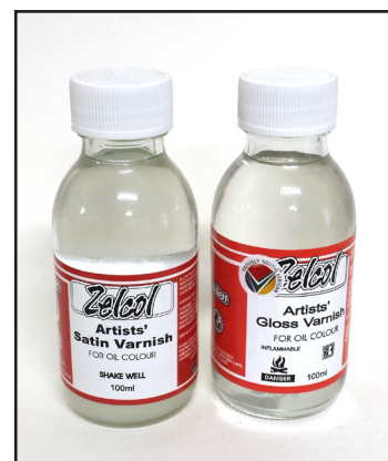
Zelcol Gloss and Satin Varnish For oil colour. Available in 100ml and 500ml. (Gloss A0038, 0538) (Satin A0039, A0539)