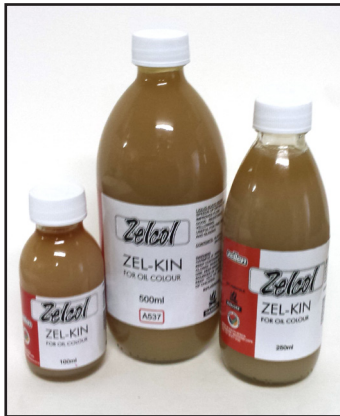
Zel-kin Quick drying medium (Liquid Alkyd Resin) Available in 100ml, 250ml, and 500ml. (A0037, A0237, A0537)