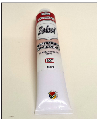
Impasto medium for oil colour Available in 100ml tube (B37)