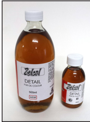
Zelcol Detail Quick drying medium - detail and glazing Available in 100ml and 500ml. (A0138, A5138)